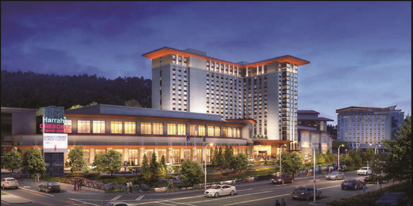
Harrah's Cherokee Casino Resort